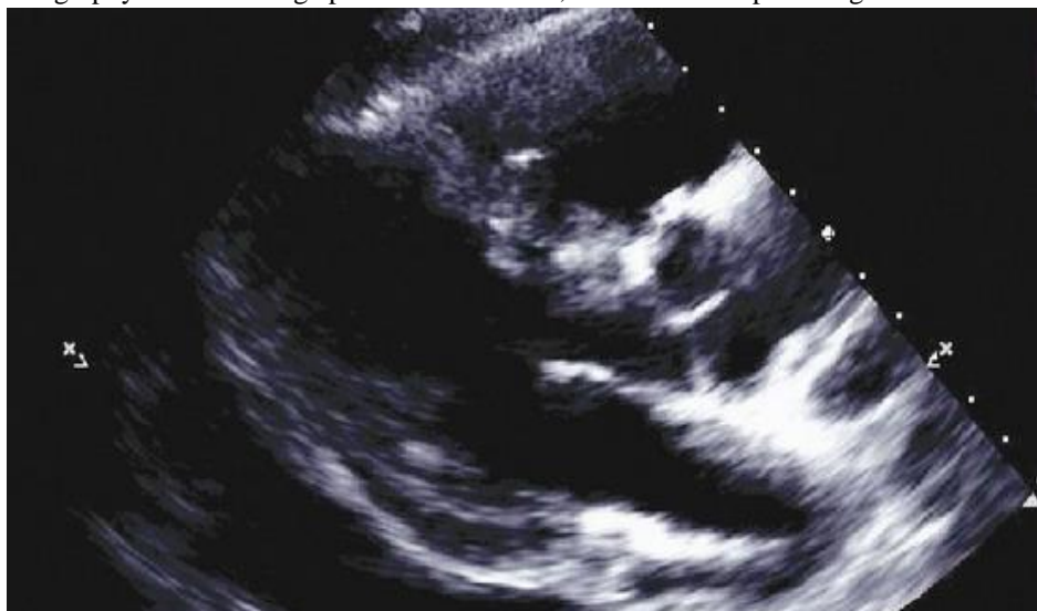
ECHO 1.11/12/2021-Large pericardial effusion

Transthoracic echocardiography showed a large pericardial effusion, with mild collapse of right atrium in diastole.